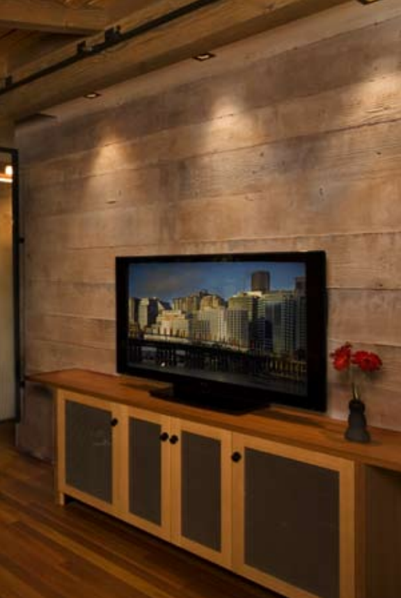
The ceiling design in the media room—reminiscent of skip sheathing—conceals acoustical panels.

of an outpost,” says the homeowner, an experienced sailor who with friends won the International One Design class in 1999 (and spent a college summer break teaching sailing at Obexer’s Boat Company in Homewood).