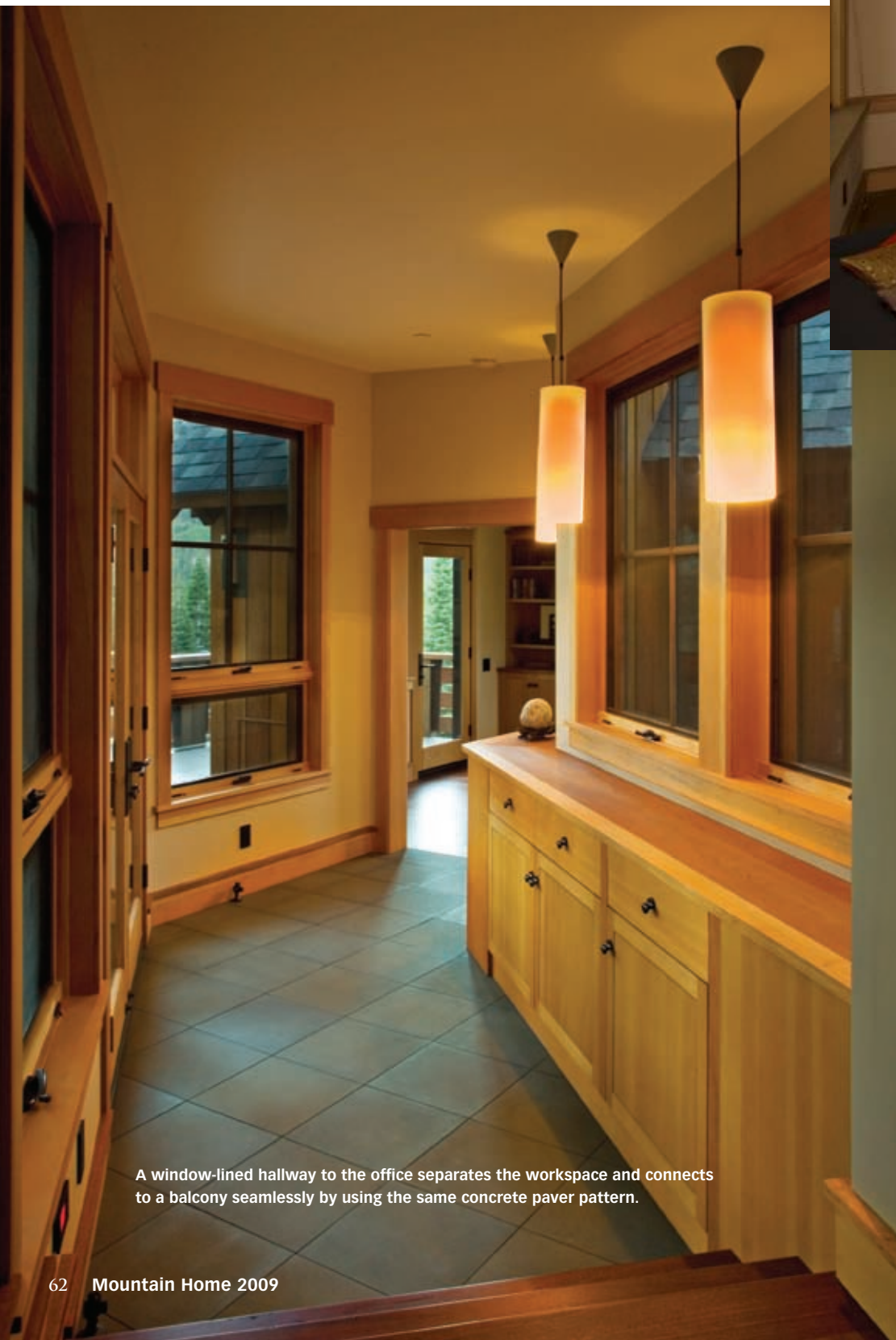
A window-lined hallway to the office separates the workspace and connects to a balcony seamlessly by using the same concrete paver pattern.

The Sonoma Cast Stone floor pattern here flows seamlessly outdoors to a balcony. These same concrete pavers are used on the back terrace, master bath and balcony, project room off the kitchen and front entry.