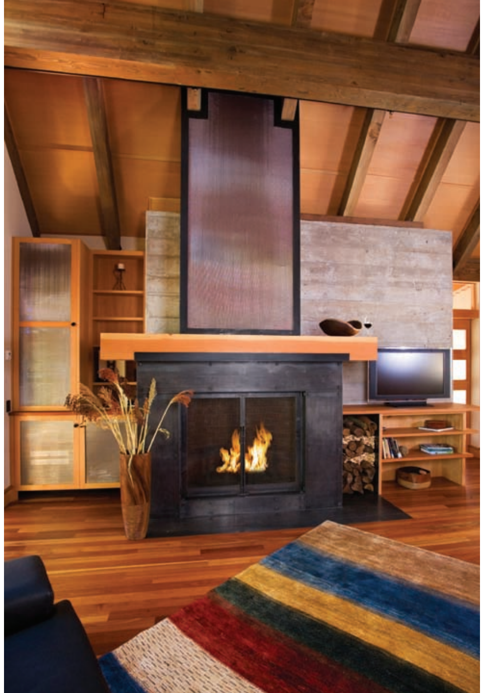
The living room exemplifies the interplay between board-formed concrete, wood, steel and glass throughout the home.

Fax 530 581-5599 P.O. Box 5535, Tahoe City, CA 96145 caroltahoe@sbcglobal.net CA 757430 • NV 0049877